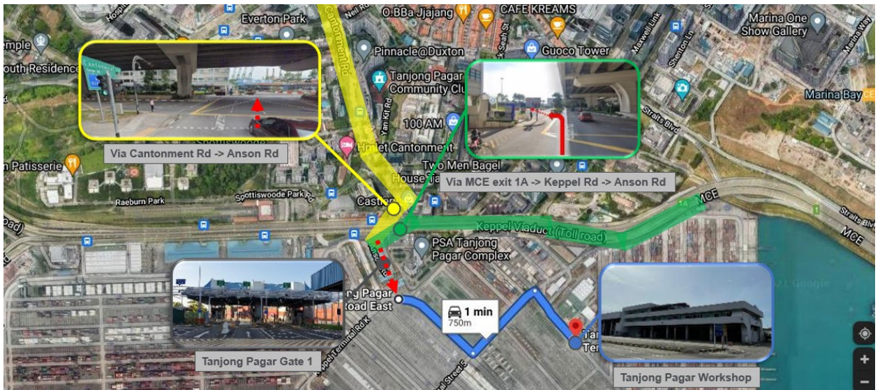
Figure 3.2: Route to Tanjong Pagar Terminal Gate 1